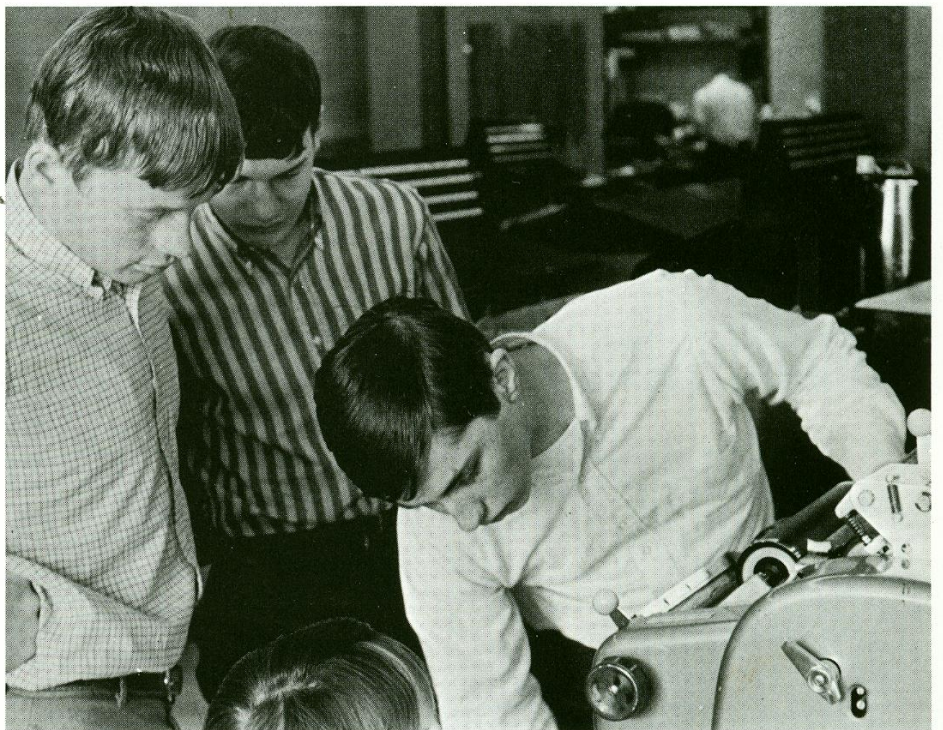
"How does this machine start, anyway?" Students labor in Industrial Arts Printing Class.