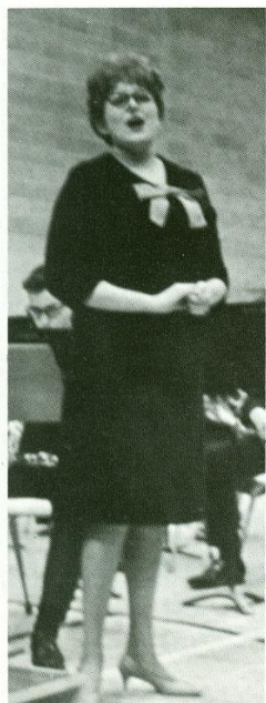
An artist from the U of M performs.