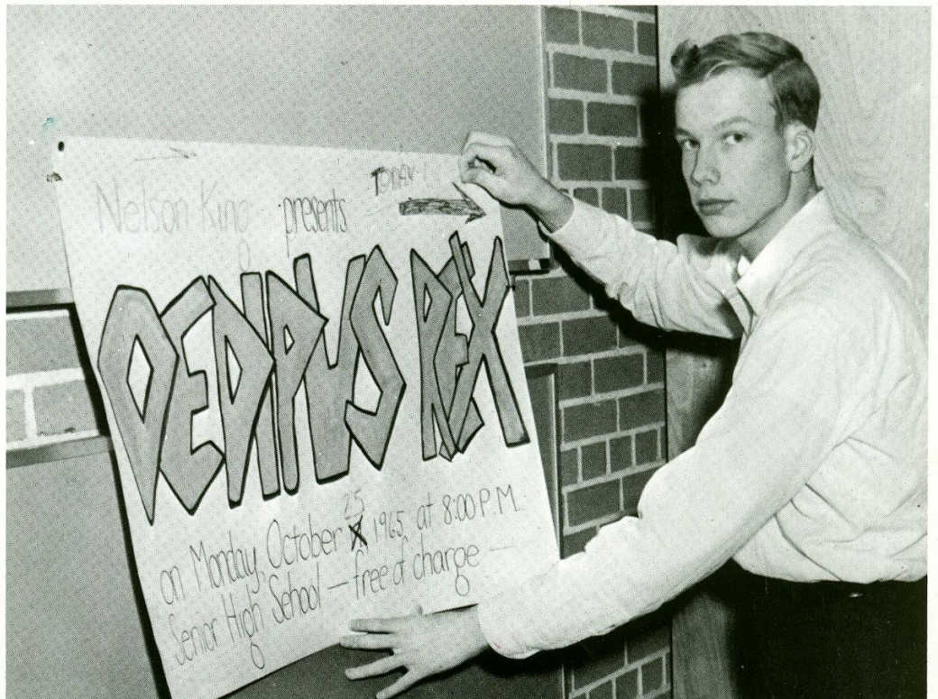
Individual creativity through drama.