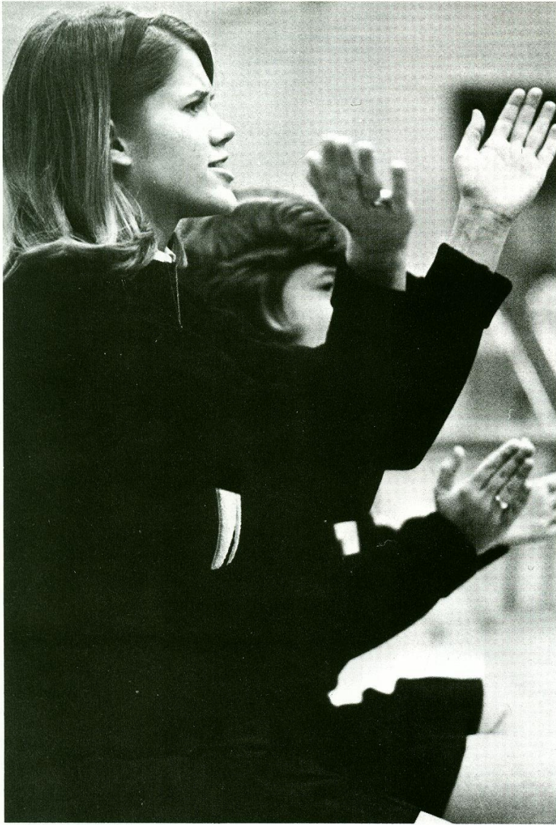
"You can do it, you can do it; show 'em, show 'em . . ."