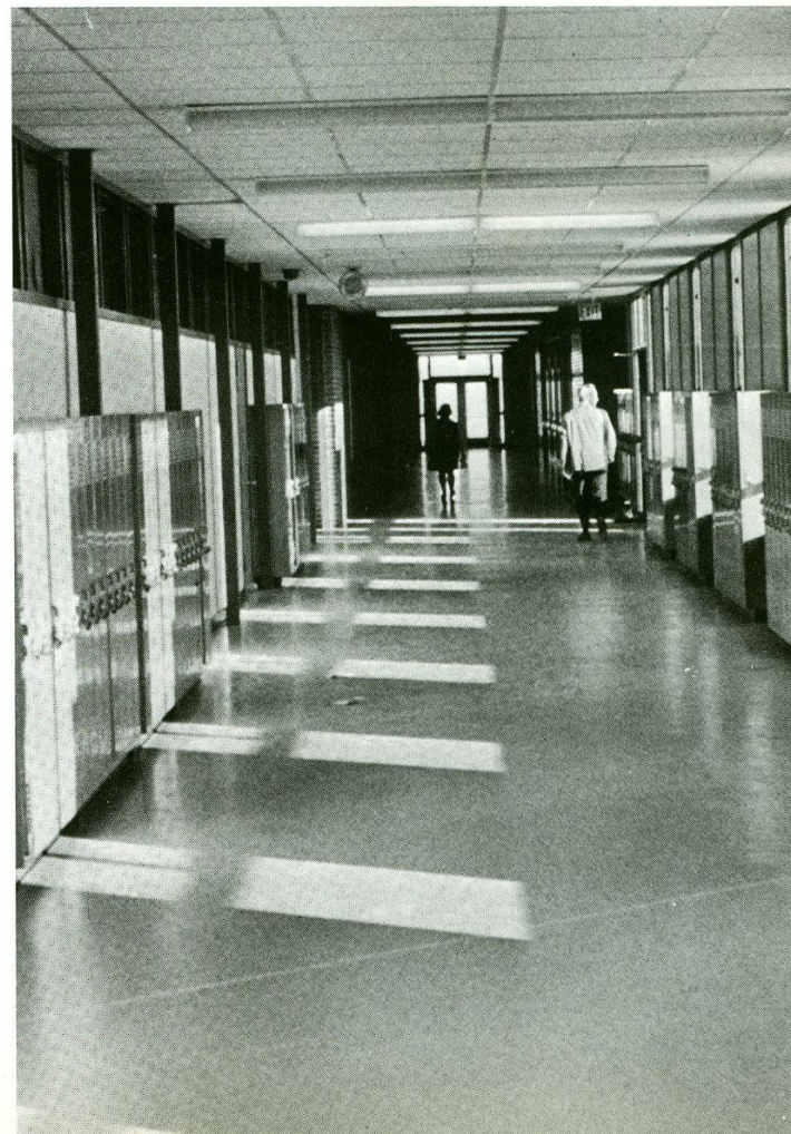
Below: The new Humanities Addition . . . The long haul— or, trying to beat the three-minute bell.