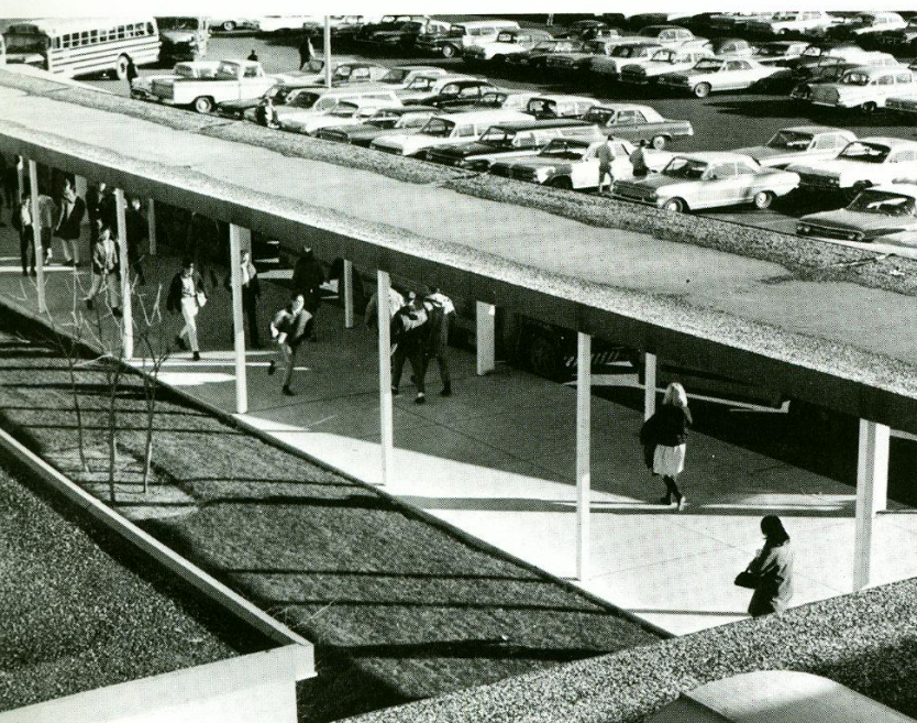
"Where's my bus?"