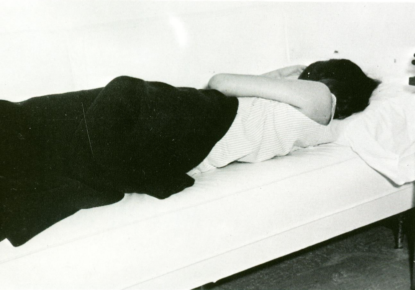
Test fifth hour ...