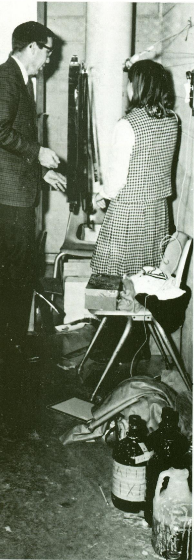
Efficiency in the dark room.